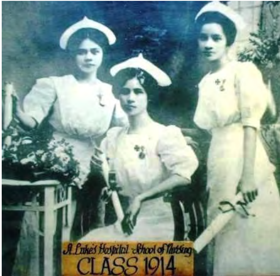
Graduates from a nursing school established by Episcopalian missionaries in Quezon, 1914

The first modern nursing school in the Philippines was established in 1906, following Baptist missionaries' realization that they would need more local help to staff their medical clinics and hospitals. Dozens of other Christian missionaries followed suit, establishing nursing schools throughout the islands.